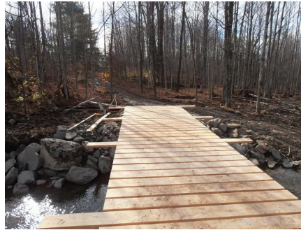
The rebuilt bridge behind Esperance Auto