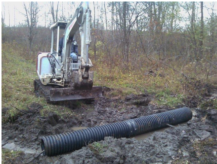
Brian Buchardt buries a culvert above Knox on C7B.

Up in Mariaville the bridge off of Spook Hollow Rd needed to be reset. Throughout the area, many trees had come down and needed to be cut up and removed.