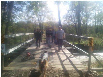
Club members cross the Knox ball field bridge.

Work parties have run almost every weekend since the storms, usually both Saturday and Sunday. Many times multiple work parties were going on in different areas the same day.