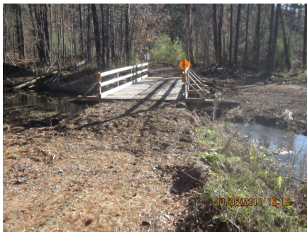
The raised and reset bridge at Rt146 above Gallupville