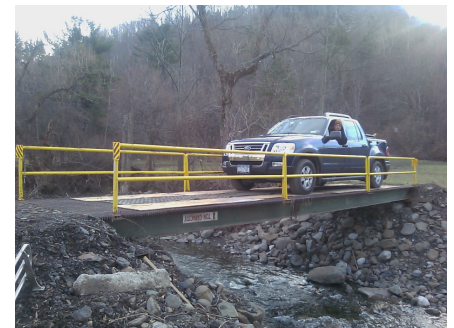
The reset steel deck bridge near the Maple Inn.