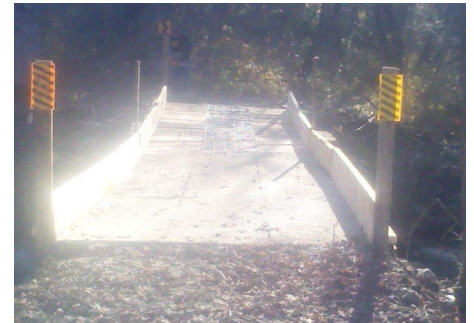
The rebuilt bridge on S70 near Joslyn School Rd.